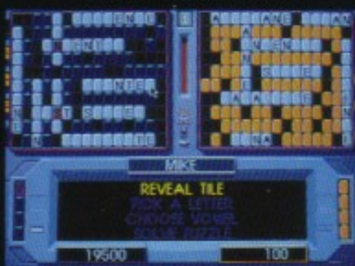
Macintosh Screen Pictured.