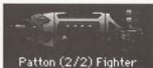
Patton (2/2) Fighter

Scouts and Fighters are your basic ships. The difference between scouts and fighters is a trade-off between Engines and Weapons. Scouts can have a Range two units higher than your Range Tech. Unfortunately, their maximum Weapon and Shield Tech is one lower than your current levels. This makes Scouts ideal for exploration, but not too good at combat.