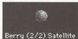
Berry (2/2) Satellite

Satellites are ships that don't have engines. That means that their Range is zero. Satellites are a cheap, effective means of defending your planets against enemy attack. Unfortunately, they can't move; they can only defend the planet where they're built. Satellites are much smaller than normal ships, so it doesn't take as many shots to destroy them. Of course, it doesn't take nearly as much metal to build Satellites as Fighters, either.