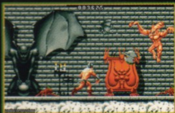
Axe your way out of Tnarom's Palace...