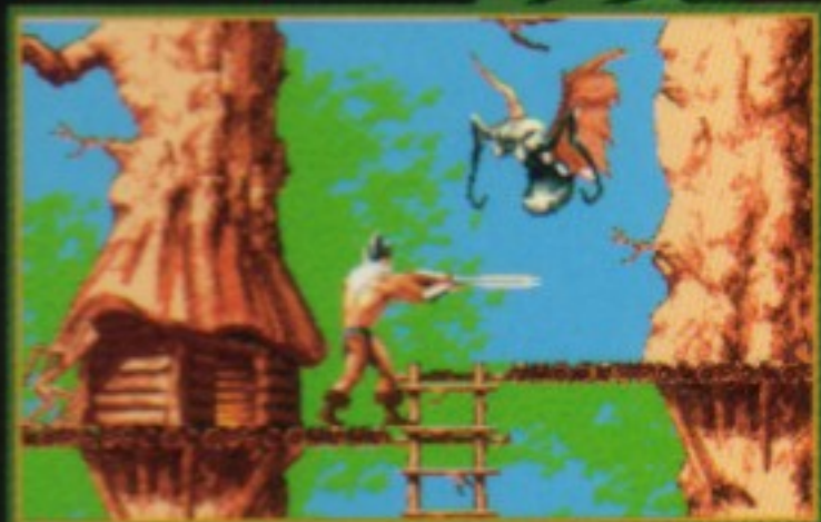
find your way thru the Enchanted Forest...

© 1993, ARCADIS, INC. & 21ST CENTURY LTD. DELIVERANCE IS A TRADEMARK OF ARCADIS AND MACINTOSH IS A REGISTERED TRADEMARK OF APPLE COMPUTER. MANUFACTURED IN USA BY INLINE SOFTWARE. REQUIREMENTS: SYSTEM 6.07 OR HIGHER, 4MB RAM AND A HARD DISK, ANY MACINTOSH WITH A COLOR MONITOR.