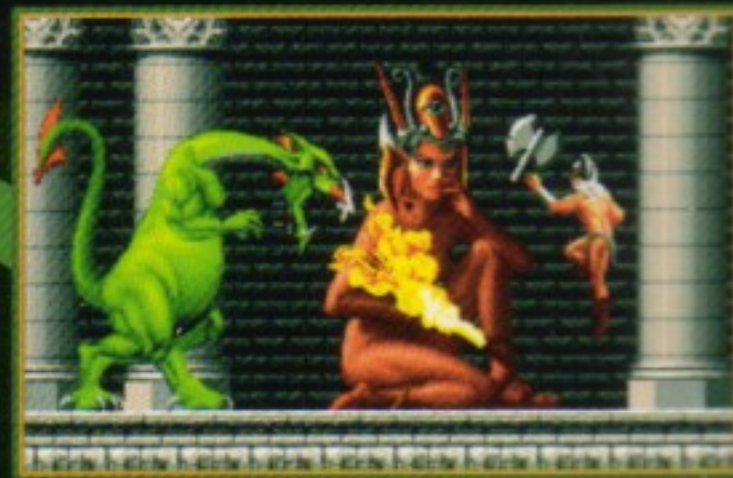
to meet the first Guardian...

LLYN CERRIG, A PLACE OF GREAT NATURAL BEAUTY AND WONDER IS THREATENED BY TNAROM WHO TRIES TO DESTROY ITS BEAUTIFUL HARMONY BY IMPRISONING THE FAIRIES, THE GUARDIAN ANGELS OF THE KINGDOM. AS THE STORMLORD, YOU HAVE BEEN GIVEN THE TASK OF LOCATING AND FREEING THE FAIRIES FROM TNAROM'S PALACE. DURING YOUR JOURNEY, YOU WILL BE ATTACKED BY EVIL MINIONS WHO WILL TRY DIFFERENT WAYS TO KILL YOU. ONCE THE FAIRIES HAVE BEEN FREED, YOU MUST GUIDE THEM SAFELY THROUGH THE PITS OF FIRE, THE ENCHANTED FOREST AND THE WINGED WARRIORS FILLED SKIES TO THE KINGDOM OF LLYN CERRIG. AT THE END OF EVERY SECTION OF YOUR QUEST, YOU WILL FACE A FEARSOME GUARDIAN WHO MUST BE SLAIN FOR YOUR JOURNEY TO CONTINUE.