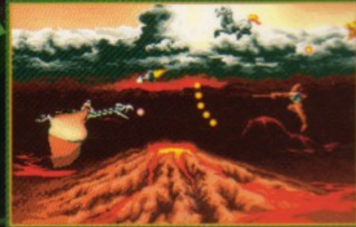
on a flying dragon thru the Winged Warriors Filled Skies, you must return to the kingdom of Llyn Cerrig